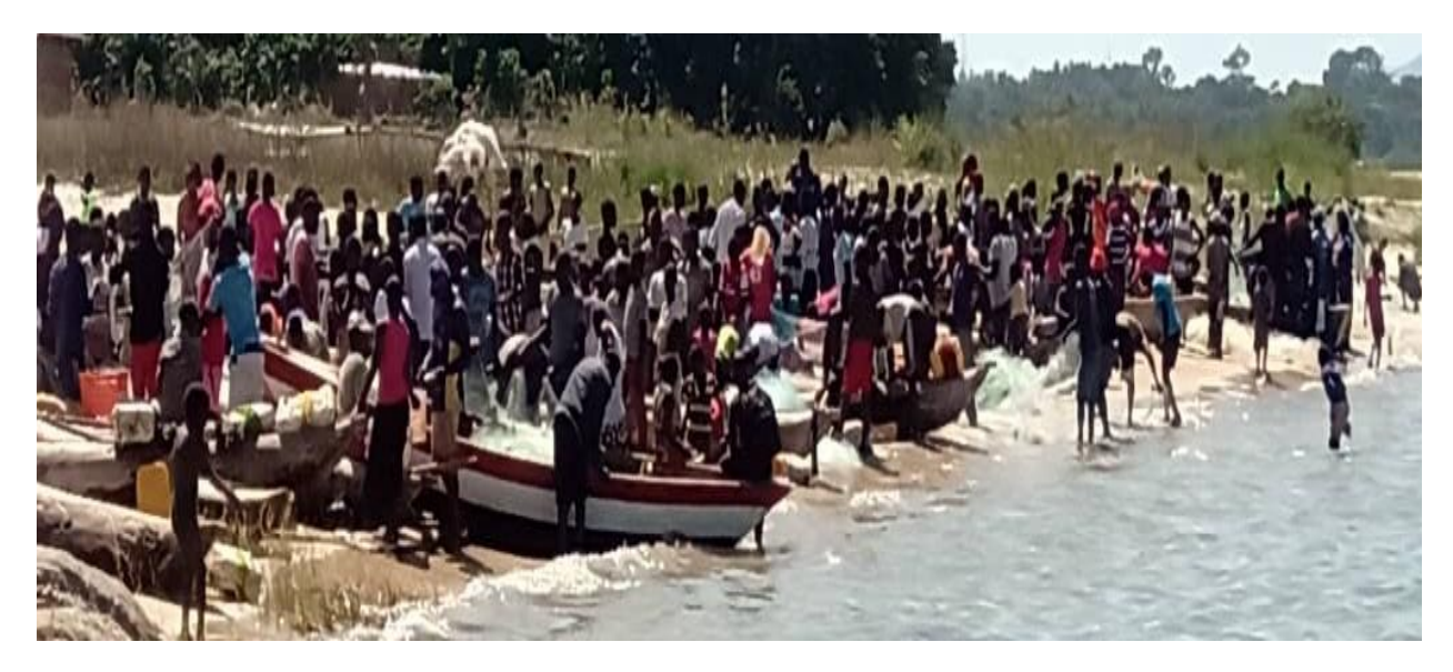
Figure 1: No physical distancing. Chigumbuli Beach fish landing, May 20 2020

It is clear from Table 1 that public and private medical and health service providers, and the ad hoc markets ( salula ), have responded positively and adhered to the prevention measures by at least providing handwashing facilities in their precincts. Also, the local tailors have responded creatively by starting to sew facemasks for sale. However, the most frequently visited places, such as drinking pubs and fish landing sites, had no handwashing facilities and did not take physical distancing precautions. Only 3 of the >100 immobile shops had hand washing facilities. Only 7 out of approximately 1000 people that day were observed with a mask on. There was no social and no physical distancing as Figure 1 illustrates: