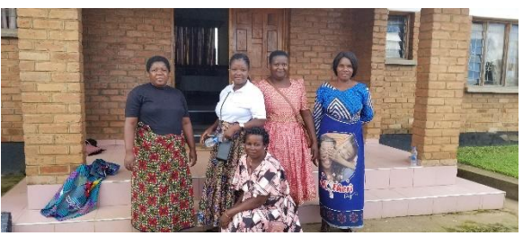
Figure 3: The Women Market Committee members after meeting Mzuzu City CEO on 19th April 2023

The key results of the study revealed that women are underrepresented in market committees meaning that they are not actively involved in market governance and decision-making. Decision making issues in the market relate to size of trading space and positioning of the site of the trading space in relation to the main entrance and visibility potential to customers. To access such trading spaces was seen to be associated with power derived either from holding an elected position in the market committee or having adequate capital with which to influence the decision making market elite. The main committees were men dominated and women only held lower level positions.