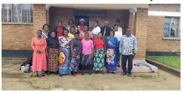
Figure 2: Elected Women Market Committee at Mphatso Motel fellow women in market advocacy issues with Mzuzu City. During the training the

Currently Mzuzu City Council Bye Laws are not gender sensitive and the committees that government traders' affairs do not recognize the roles women play in the market governance. The findings of the research showed that women traders have less capital and profit returns which puts